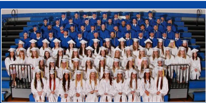
Elmwood High School Class Of 2019

Congratulations to the 2019 Graduating class of Elmwood High School!!!