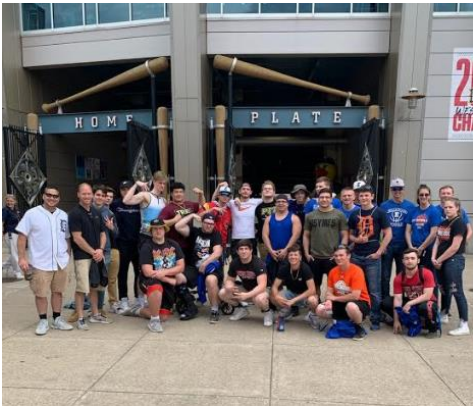
The high school Advanced PE and Rec Sports class traveled to the Toledo Mud Hens game